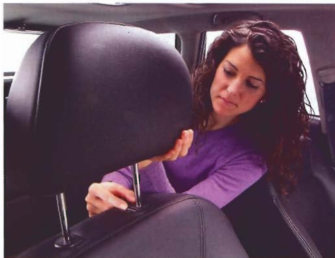
1 Remove the headrest. Most models have a release button; others may need a slim screwdriver or putty knife to release the catch.

Seat covers come in basically three levels: the universal fit, which we show how to install in this article; the semi-custom fit, which is a bit more tailored to your car seat's contours; and the custom-fit, which is made more exacting to your car's seat specs and has a separate back, seat and headrest cover (photo below). The prices vary considerably, but you can expect to pay $30 to $50 for universal fit, up to about $100 for semi-custom and up to $200 or more for custom covers. Most auto parts stores stock only universal fit covers, so if you want more choices, look in the Yellow Pages under "Auto Seat Covers" for custom upholstery, or check the Buyer's Guide at the end of this article for Internet and catalog buying.