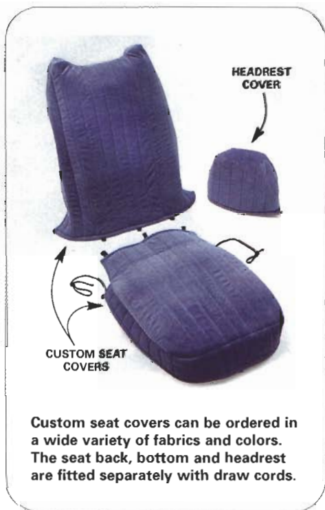
Custom seat covers can be ordered in a wide variety of fabrics and colors. The seat back, bottom and headrest are fitted separately with draw cords.