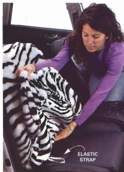
3 Push the elastic straps through the gap between the back and the seat bottom.